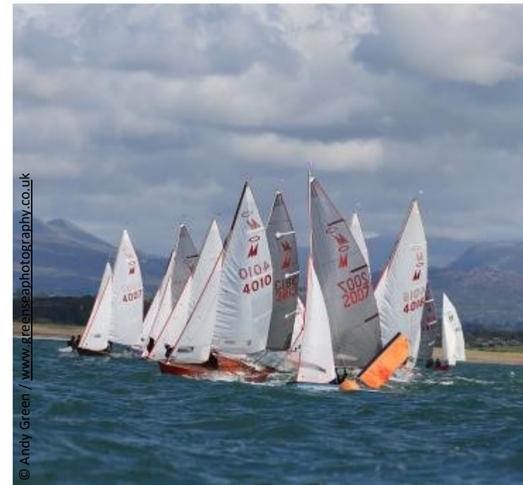
Starting at the Pwllheli Nationals

Miracle Association Magazine Autumn 2019